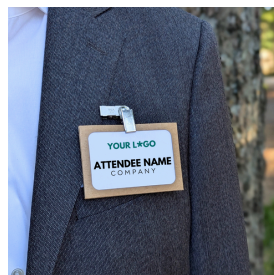
Kraft Paper Name Tag Holder w/ Clip $1.45 - $0.75