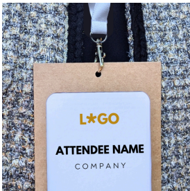
Kraft Paper Badge Holder, 4.25" x 6" $1.40 - $0.65