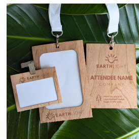
Wood & Paperback Badges/holders $3.78 - $1.28