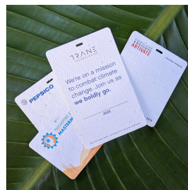
Seed Paper Badges, Multiple Sizes $3.16 - $0.84