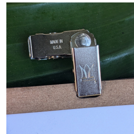
Reusable Double Clip $0.65 - $0.30