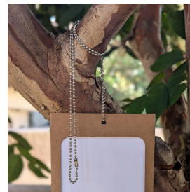
Ball Chain Lanyards $0.39 - $0.29