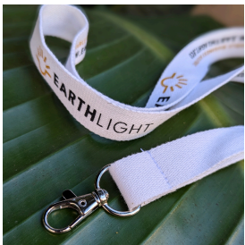
Organic Cotton Lanyards w/ Hook $3.14 - $0.59