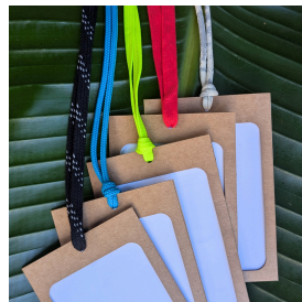
Recovered Dead Stock Lanyards $0.55+