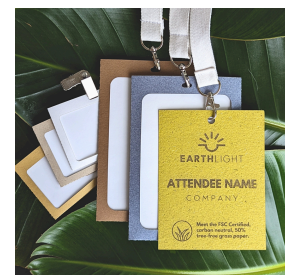
Premium Recycled Paper Badges/holders $2.20 - $0.82